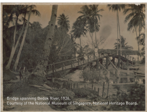
Bridge spanning Bedok River, 1926.

The history of Bedok and East Coast reflects a meeting of many cultures brought into the area by the early settlers – a legacy that can still be found in the street names and architecture here today. Its location by the sea attracted many immigrants who lived off the fishing trade, and for others, it was a relaxing place for a beachside holiday.